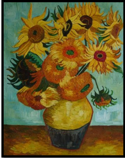
This painting of sunflowers is one of the most famous paintings in the world. Vincent Van Gogh painted a whole series of Sunflower compositions during his lifetime